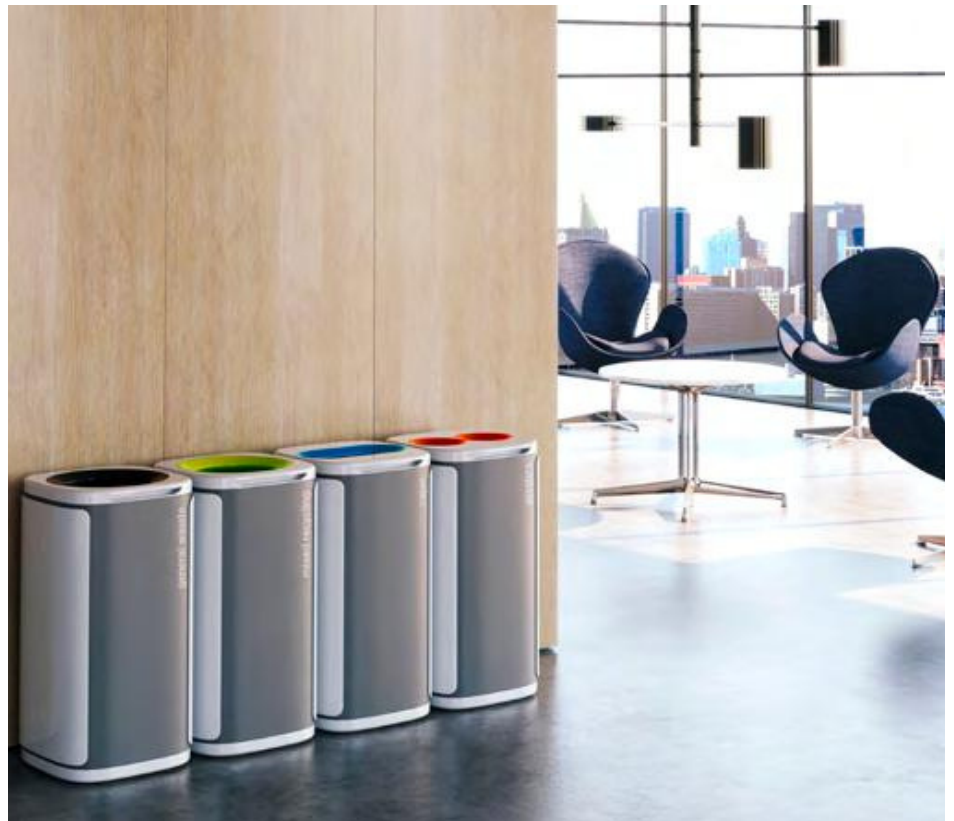
Graphics and colors help to separate types of waste.

The WASTE project originates from the belief that technology and design must meet the challenge of sustainability, so that aesthetically beautiful and elegant products have to be ecological, as well as functional.