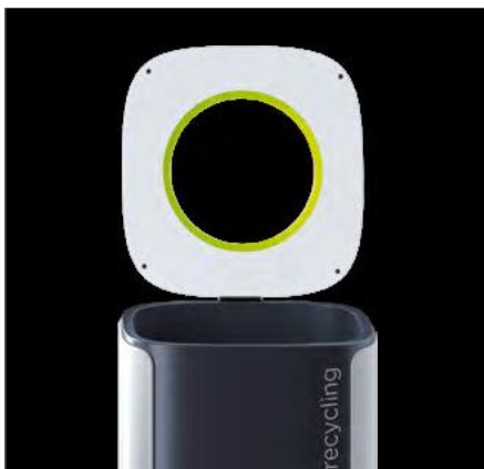
Quick and easy replacement of the bag.